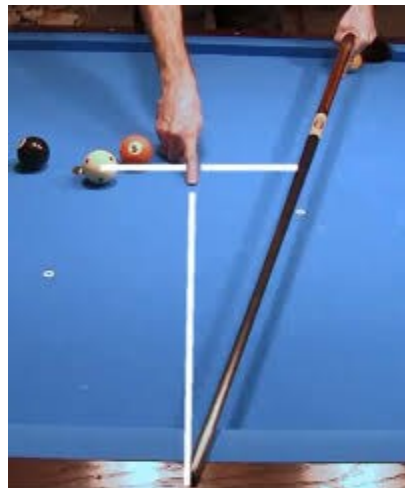
Image 5 - 1-Rail Kick