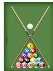
TABLE 21: RAY RESSLER VS DAVE CLARKOWSKI

TABLE 1: NATHAN DECKER VS JIMMY MCKILLOP